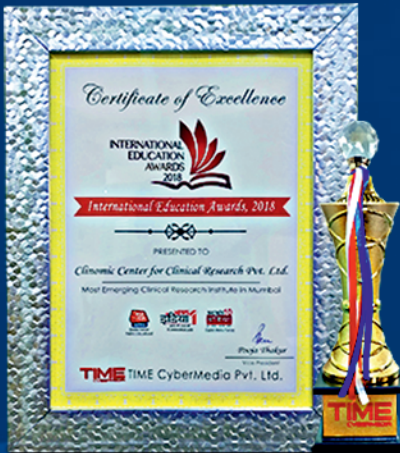
International Education Award 2018 for Most Emerging Clinical Research Institute in Mumbai