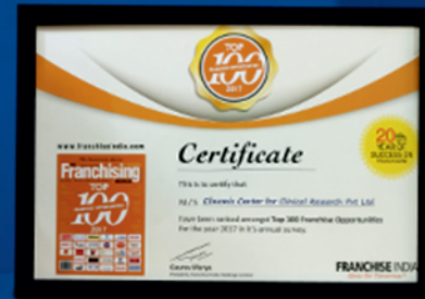
Top 100 Franchise Opportunities for the Year 2017