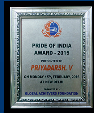
Pride of India Award 2015